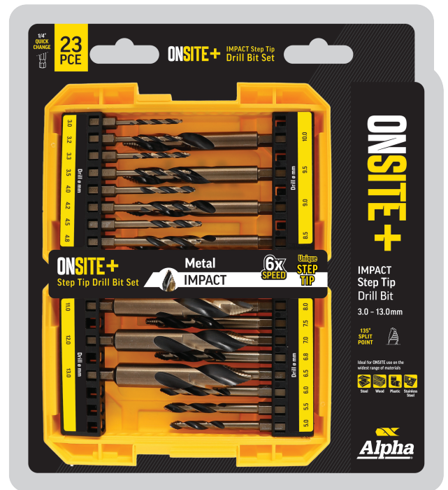
23 PCE SET Sizes 3.0 - 13.0mm