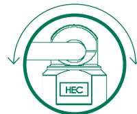
180° lateral ring rotation